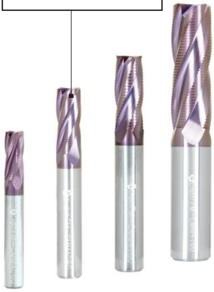
FM-CMM series 鎢鋼粗銑端銑刀 Carbide roughing cutter 更多規格詳見第B52頁 Reference Page-B52