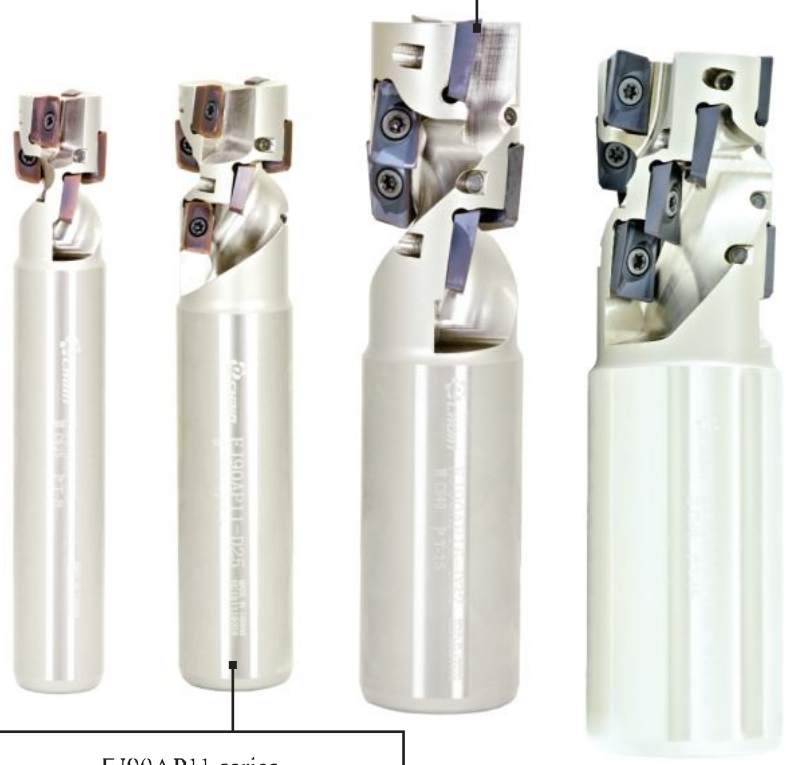
EJ90AP11 series 粗銑端銑刀 Disposable Roughing Milling Cutter 更多規格詳見第J16頁 Reference Page-J16