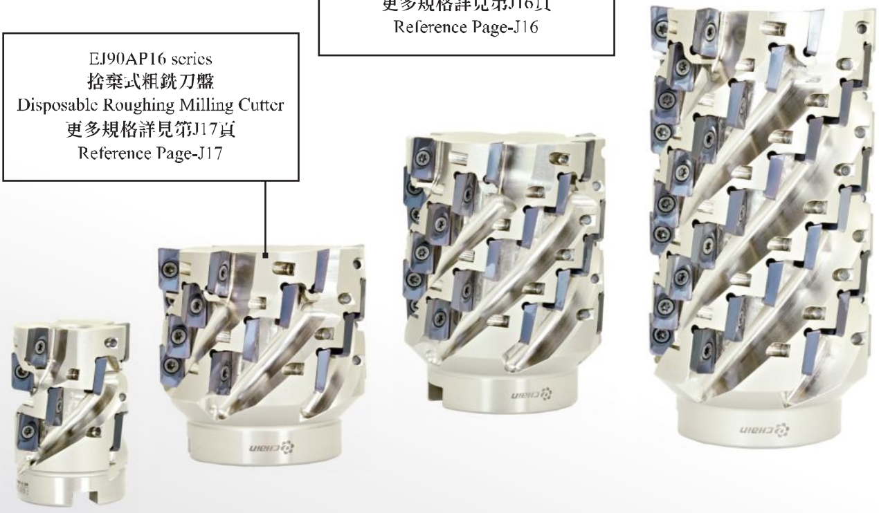
EJ90AP16 series 捨棄式粗銑刀盤 Disposable Roughing Milling Cutter 更多規格詳見第J17頁 Reference Page-J17